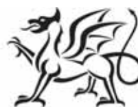
Llywodraeth Cynulliad Cymru Welsh Assembly Government